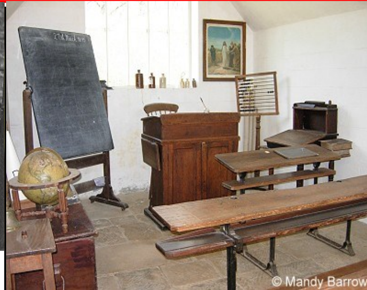
Schools were not free until 1891. Up until then children had to pay to go to school.