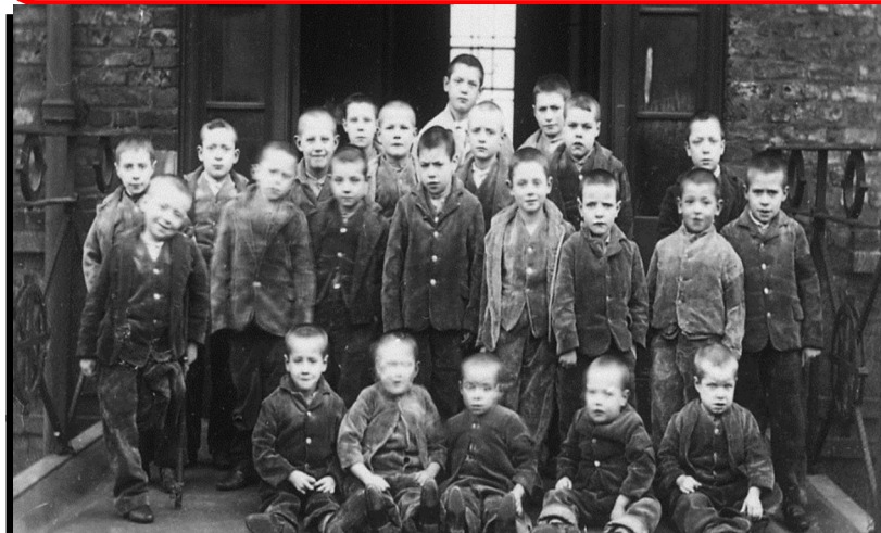
Workhouses were introduced in 1834. The last workhouses in the UK did not close until 1930!