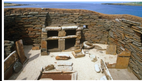
Skara Brae is a stone-built Neolithic settlement, located on the Bay of Skail on the west coast of Orkney archipelago in Scotland.

Cave paintings are a type of art, found on the wall or ceilings of caves. They are usually prehistoric origin, and the oldest known are more than 44,000 years old